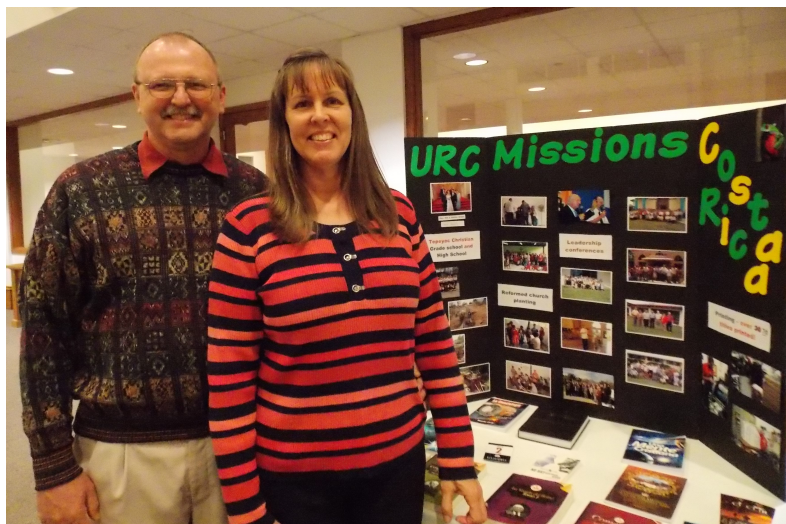
After visiting 26 churches, we say “¡Adios!” We are heading for Costa Rica soon.

very encouraged with regards to our ministry as well. Please keep Costa Rica in your prayers as we move into this new year.