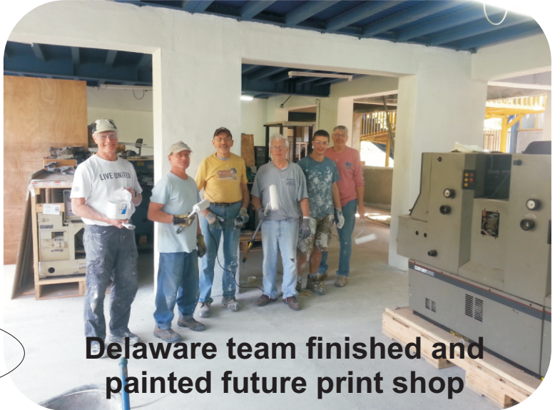
Delaware team finished and painted future print shop