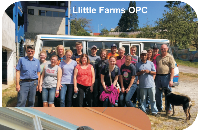
Little Farms OPC