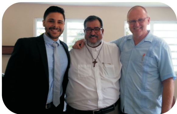
The three conference speakers